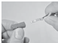
Figure 1 - Inserting Contact Using Insertion Tool