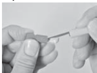
Figure 2 - Full Insertion