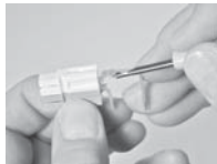
Figure 3 - Multi-Row Block Construction Steps; Block Housings, Insert Lower Row Contacts, Insert Upper Row Contacts