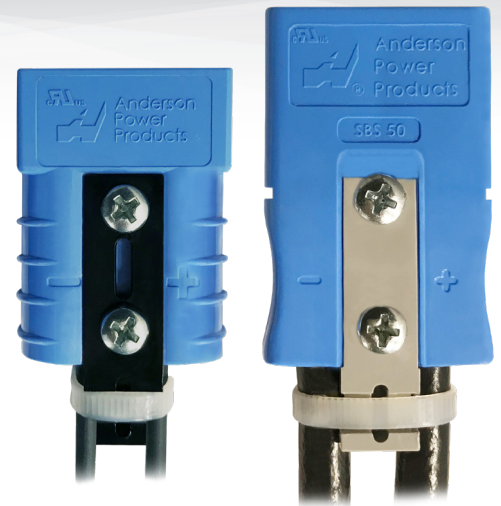
SB50 Assembled (Connector not included)