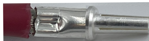
Crimped Socket Contact